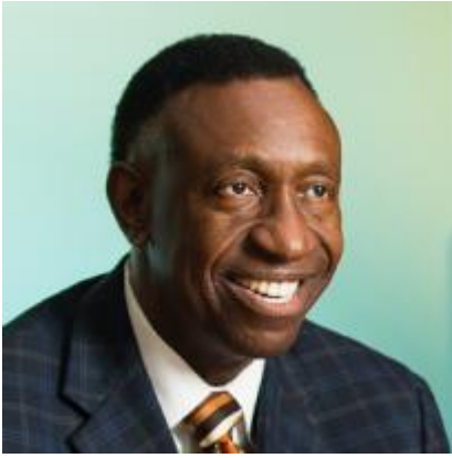
Roy Griggs Commissioner