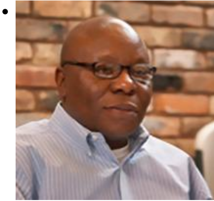
Rick Prescott Commissioner